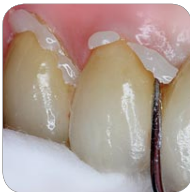
Fig. 21 Cementing with dual cement; the excess is easy to remove

■ In special cases, it may be advisable to try in the zirconium oxide framework before completing the restoration. When doing so, check the marginal fit by applying a thin-flowing impression material to the gap between the prepared tooth and the restoration. Then clean the framework with alcohol to ensure that no traces of silicone are left inside the restoration. After the impression material has set, remove the restoration from the mouth. If the marginal fit is a good one, the material will tear off cleanly at the crown margin. At this stage, a refit can be carried out using the zirconium oxide framework as a basis.