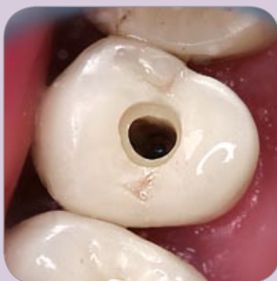
Fig. 23 Trepanation of a ZENO® crown; use generous water cooling

in other words at a tangent to the tooth. This ensures that the diamond bur is always adequately-cooled and prevents it from overheating (Fig. 23).