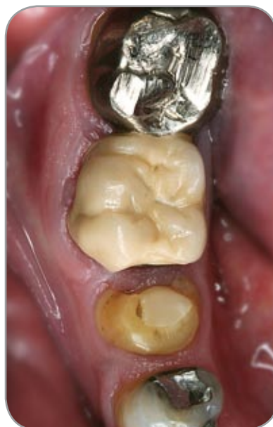
Fig. 2 Before: Inadequate restoration in the posterior region

If the patient suffers from bruxism, the practitioner must decide on a case by case basis whether a full ceramic restoration is suitable or whether a metal occlusal surface is preferable.