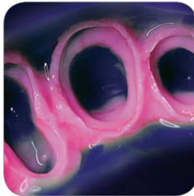
Fig. 18 Impression: all contours are clearly visible

As an alternative or in addition to the use of threads, electrotomy or laser techniques can also be used to expose the prepared margin, whereby all forms of retraction must be as gentle as possible, especially in areas where the gingiva is visible. With the electrotomy method it is advisable to use the thinnest instrument available to open the sulcus. The subsequent impression should be taken using customised or individual impression trays.