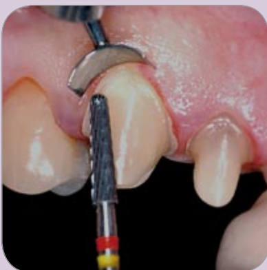
Fig. 12 Step 3: Special carbide finishing bur; an ergonomic instrument for anterior and posterior regions