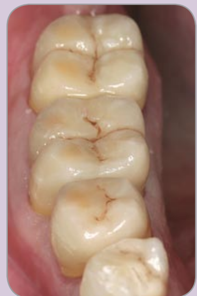
Fig. 3 After: ZENO® crowns in situ