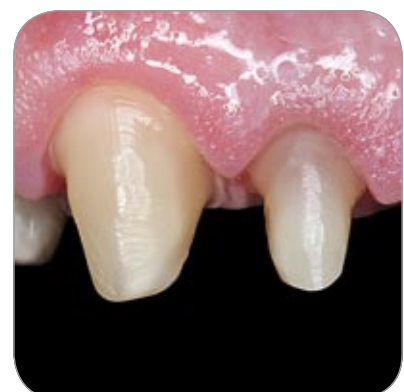
Fig. 16 The finished preparation