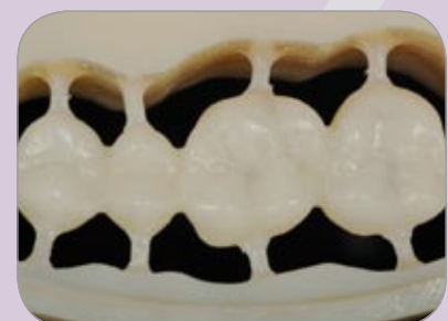
Fig. 20 Temporary restoration made from ZENO® Tec PMMA

Finally the temporary restoration is lathe polished to a high lustre and fixed onto the prepared teeth with eugenol free cement (Fig. 20)