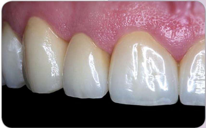
Fig. 1 Aesthetically pleasing ZENO® anterior crowns; made by Master Dental Technician F. Wüstefeld, Hanover