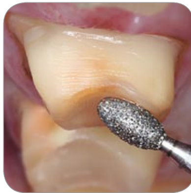
Fig. 8 Step 2: Removal of occlusal hard substance from molars