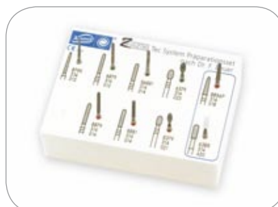
Fig. 4b ZENO® Preparation set according to Dr. Beuer