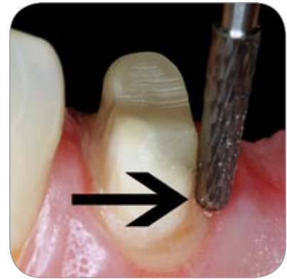
Fig. 13 Extremely safe and atraumatic finishing of the accentuated chamfer