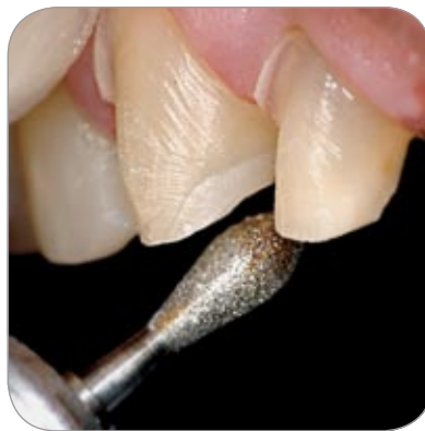
Fig. 7 Step 2: Removal of lingual hard substance from anteriors

Tip! Ensure that there is adequate space (Fig. 9). Verify this by using bite registration wax or a silicone impression.