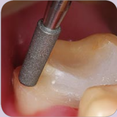
Fig. 10 Step 3: Short finishing bur for partial crowns and less accessible areas