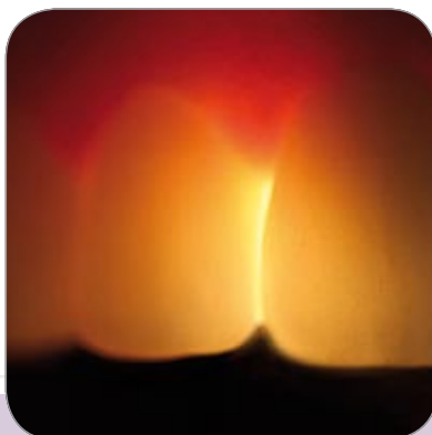
Fig. 22 High translucence and light transmission into the sulcus and the gingiva