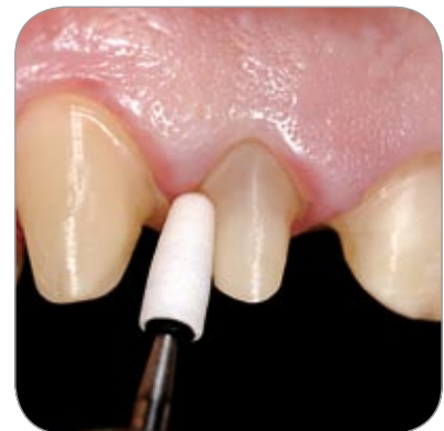
Fig. 14 For special cases a ceramic abrasive is customised with a diamond abrasive