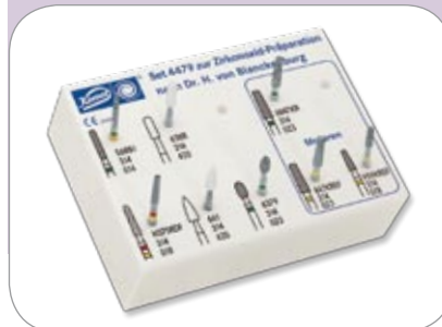
Fig. 4a Ergonomic preparation set according to Dr. H. v. Blanckenburg

The largest circumference of the prepared tooth is clearly visible in the area of the gingival preparation margin. It does not matter here whether the preparation has a distinct chamfer or is a shoulder with a rounded inner edge. At the margins the cut should be circular with a uniform depth of 1.0 mm.