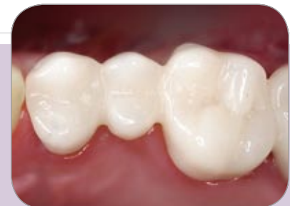
Fig. 19 Temporary restoration

With the ZENO® Tec System it is also possible for the technician to make a long-lasting temporary crown from PMMA on the CAD/CAM system within a few hours (Fig. 19).