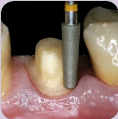
Fig. 11 Step 3: Tapered diamond finishing bur for molars