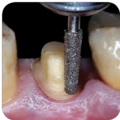
Fig. 5 Step 1: Initial preparation using a coarse diamond bur for the posterior region

Tip! An accentuated preparation margin in its final position serves as a guide for the final stages of the preparation. This initial shoulder and chamfer will subsequently guide the instrument smoothly, even in less accessible areas.