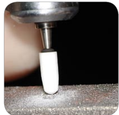
Fig. 15 Finishing the preparation and rounding all edges