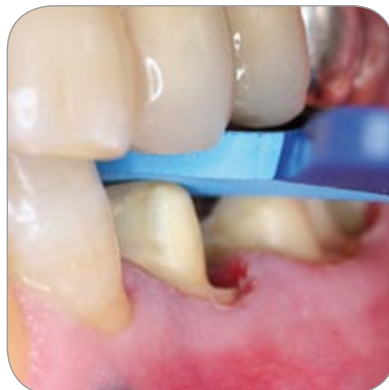
Fig. 9 Checking the space created by means of a bit registration